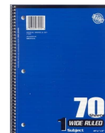
70 page 1 subject spiral notebook